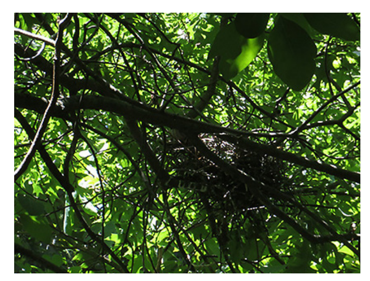
High in a Pin Oak, we observed this active Green Heron nest.