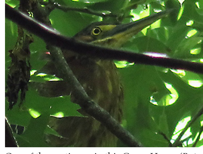
One of the nesting pair, this Green Heron ( Buto-rides virescens ) was seen perching nearby.