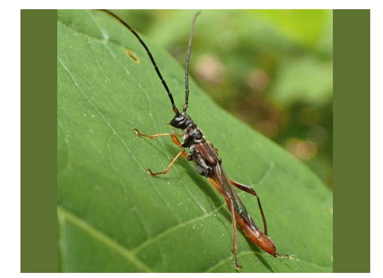
An exciting first-time ever sighting for everyone was this Long-horned Beetle ( Necydalis mellita).