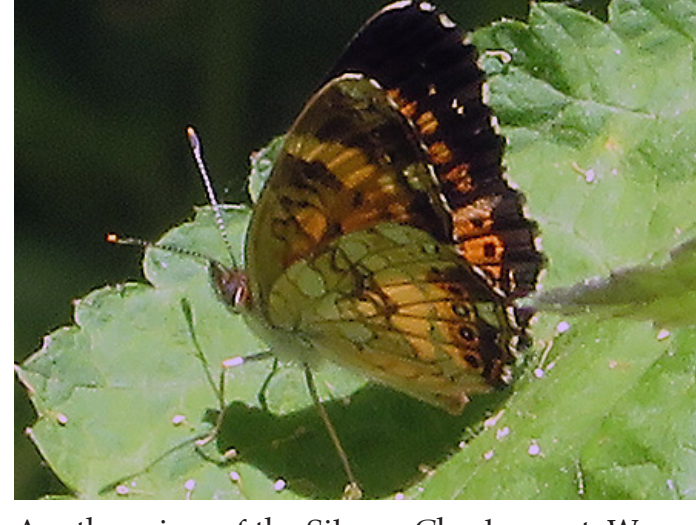
Another view of the Silvery Checkerspot. We easily saw over a dozen individuals on this day.