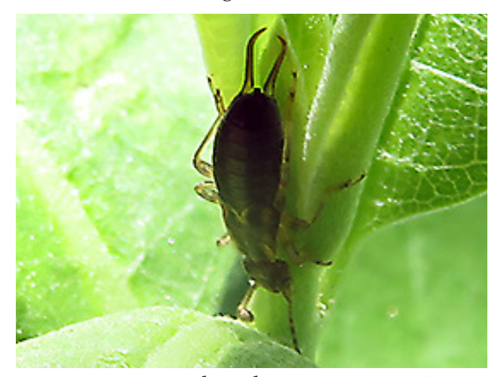
Young Earwigs such as this one can often be found within the foliage of Milkweed plants. Family Forticulidae.