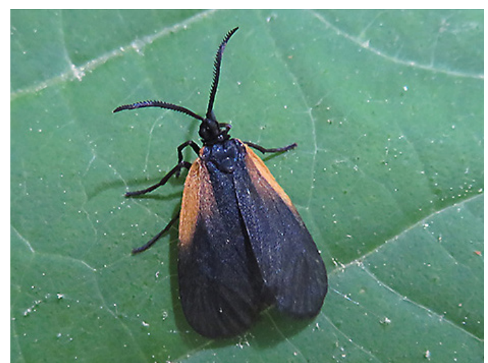
And another look-alike, yet not a beetle at all, is this Orange-patched Smoky Moth ( Pyramorphia dimidiata ).