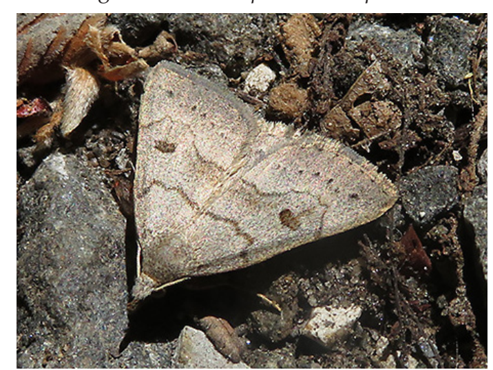
Careful observation revealed several well camouflaged Morbid Owlet moths ( Chytolita morbidalis ) perched on the ground.