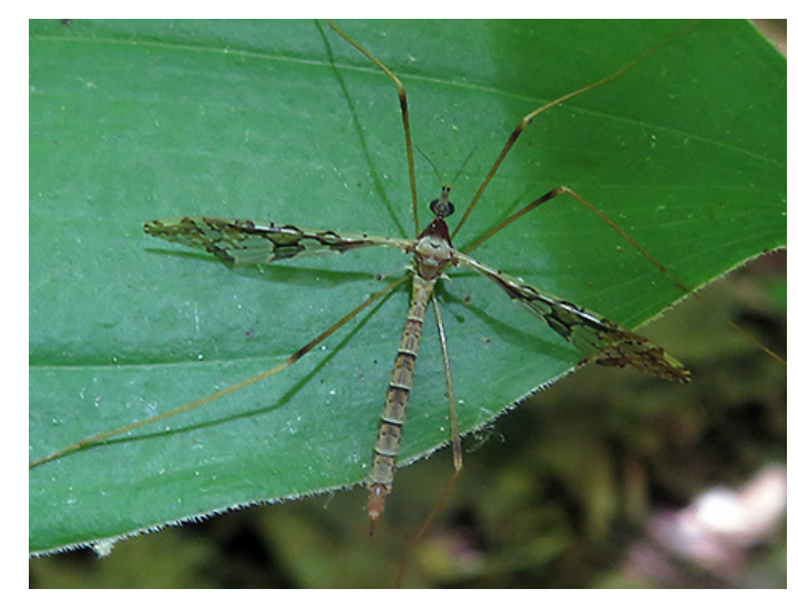
After some research, I believe this Limoniid Crane Fly may be ( Epiphragma solatrix ).