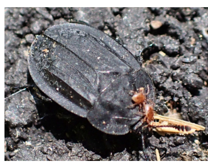
Found on decomposing remains was this Ridged Carrion Beetle ( Olceoptoma inaequale).