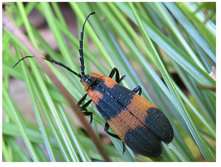
To illustrate why we use Latin names for precise identification, here is another common named, Net-winged Beetle ( Calopteron discrepans ).