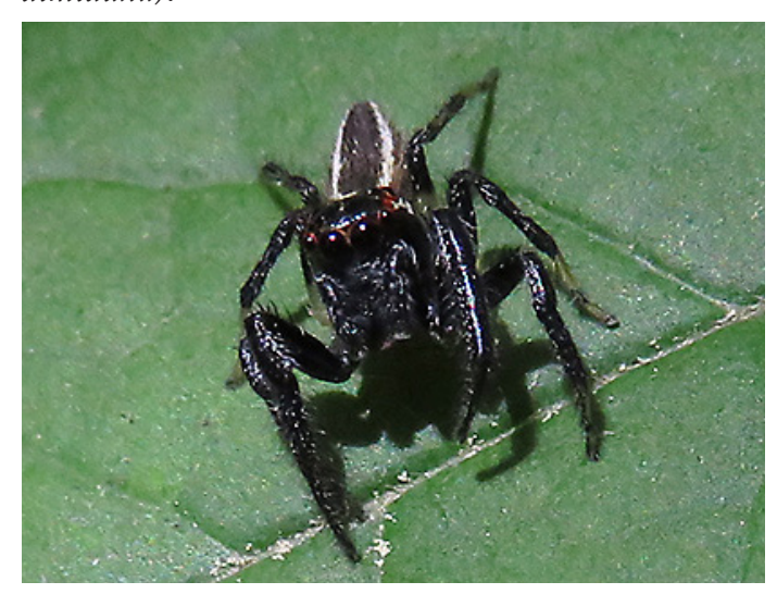
This bold fellow is a Jumping Spider of the Family Salticidae.