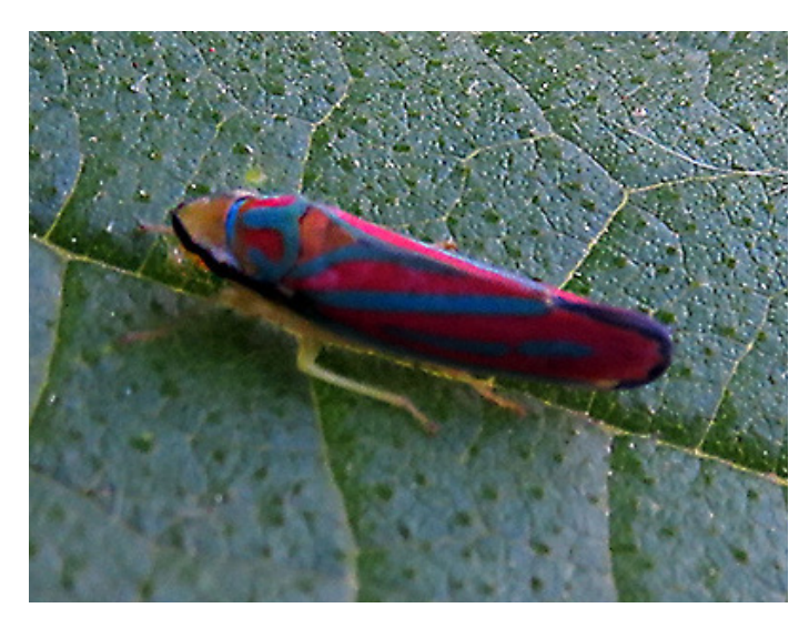
A favorite, the brightly colored Red-banded Leafhopper ( Graphocephala coccinea ).