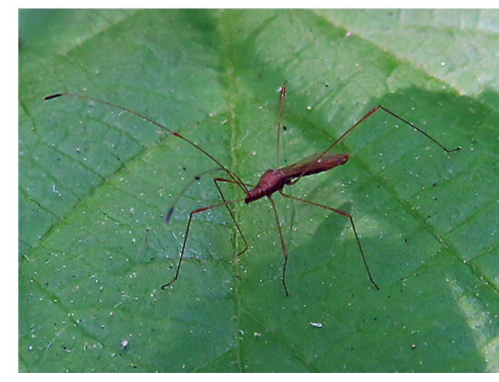
Balancing on its long, spindley legs, the wellnamed Stilt Bug makes its way across a leaf. Family Berytidae.