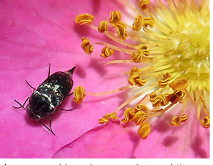
This tiny Tumbling Flower Beetle ( Mordella marginata ) was found on a wild rose blossom.