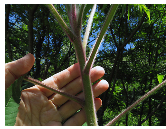
The fine, velvet-like hair on its stalk indicates that this is Staghorn Sumac ( Rhus typhina ).