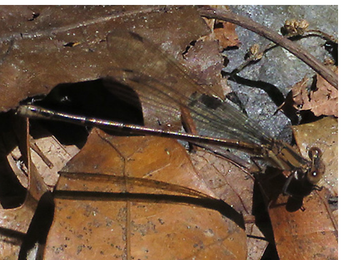
Variable Dancer ( Argia fumipennis ) this female was found blending in with the forest leaf litter.