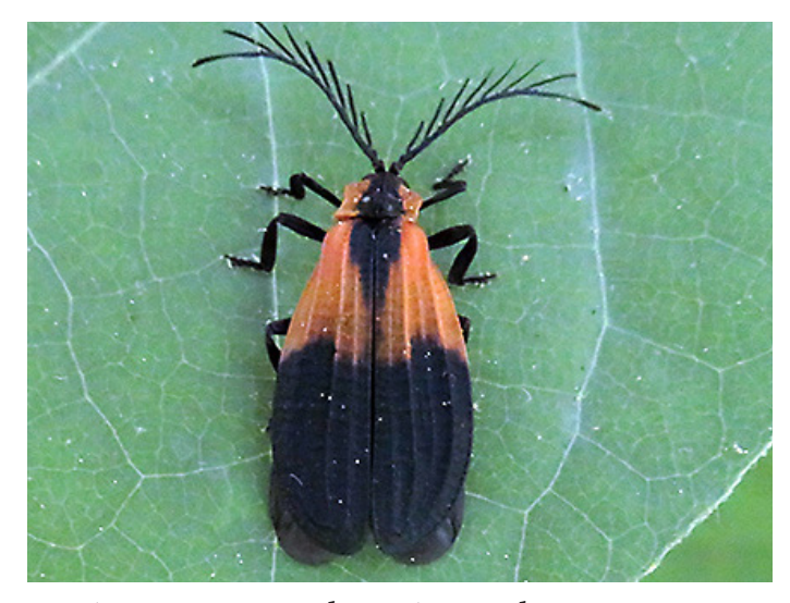
Easily confused in the field are the 3 orange and black insects on this page. The one above is called a Net-winged Beetle ( Caenia dimidiata ).