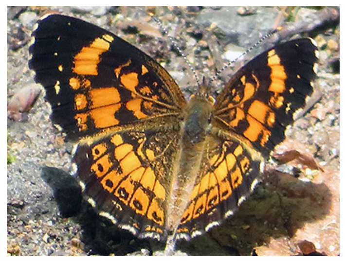
We were successful in finding our target species, the Silvery Checkerspot ( Chlosyne nycteis ).