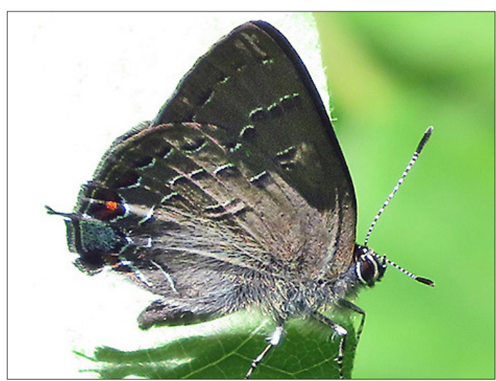
Another good sighting was this Banded Hairstreak ( Satyrium calanus ). It cooperatively perched for us allowing for photographs..