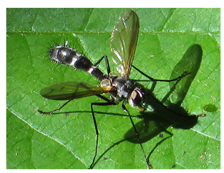
Less seen elsewhere in NYC, I often observe this Tachnid Fly ( Cordyligaster septentrionalis ) in Van Cortlandt Park during the summer months.