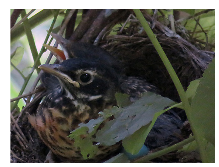
These young American Robins ( Turdus migratorius ) still in the nest, appeared ready to fledge.