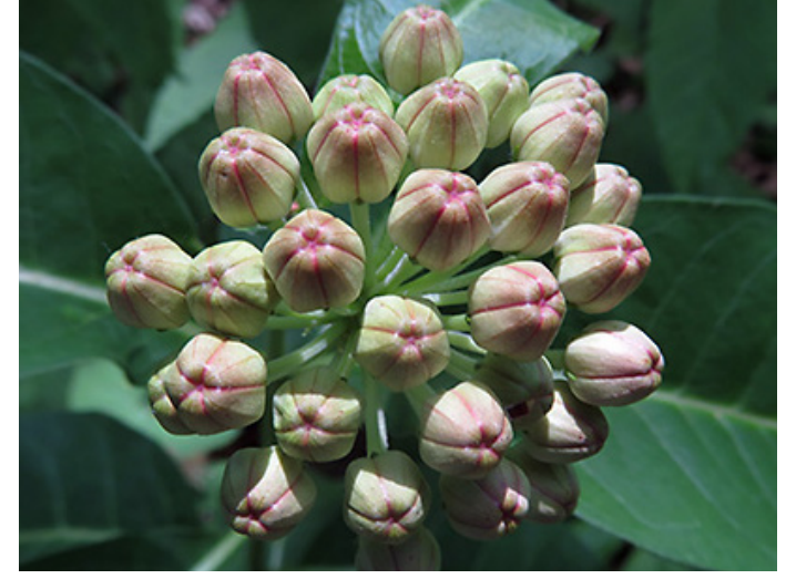
Getting ready to bloom was this Purple Milkweed ( Argia fumipennis ).