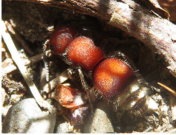
Although it goes by the common name of Velvet Ant ( Timulla sp. ), this hairy red insect is actually a wasp.